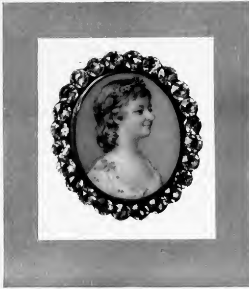
CHARLOTTE, DUCHESS OF ALBANY, DAUGHTER OF CHARLES EDWARD STUART BY CLEMENTINA, TENTH DAUGHTER OF JOHN WALKENSHAW (1753-1789) BY OZIAS HUMPHRY